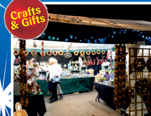
Crafts & Gifts