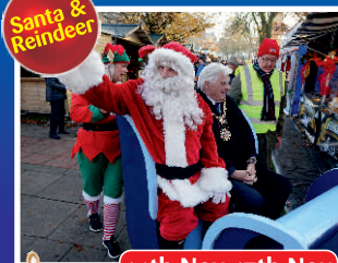
Santa & Reindeer