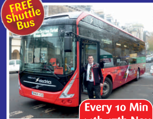
FREE Shuttle Bus