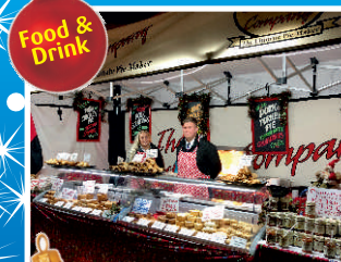
Food & Drink

with a Yorkshire flavour - fun for all the family!